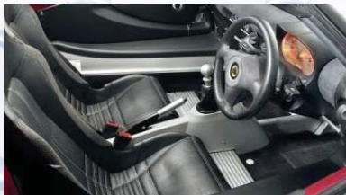
Protects upholstery against spills and stains!