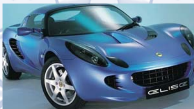
Protects car paintwork - never polish it again!*