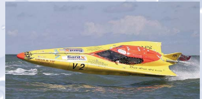
GardX protects the 'Bat out of Hell' race boat in the V24 Offshore Powerboat Championship.

An exclusive leather treatment which seals the hide, protecting it against stains, dirt and liquid spills. At the same time moisturising the leather to retain that supple natural look and feel.